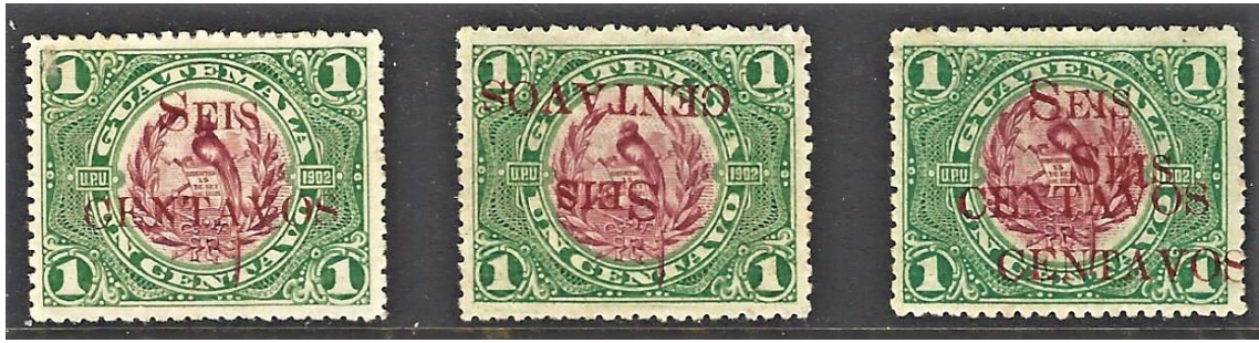
Scott 155 - Fake Red Surcharges