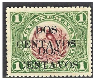
Scott 154 Violet Center