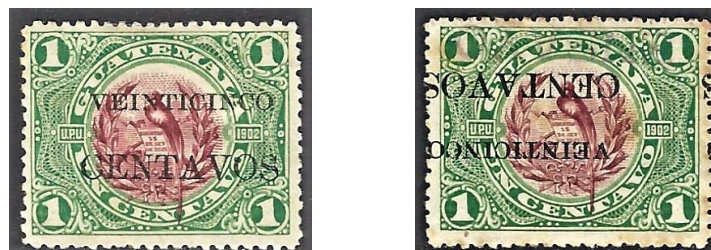
Scott 157 - Bogus Surcharge