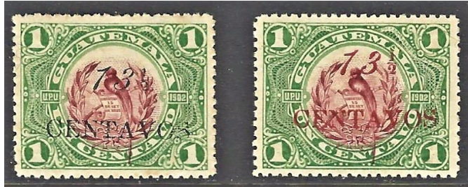
Scott 156 - Fakes on Violet Center Stamps and Red Fakes