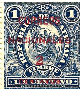
Scott 87 Forgery Correos — 14mm Nacionales — 21mm Centavos — 13.5mm Height — 22mm