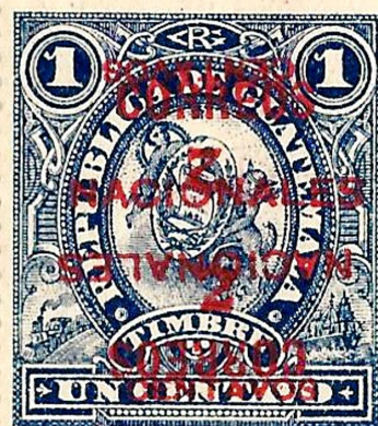
Scott 87 Forgery Correos — 13.5mm Nacionales — 20.5mm Centavos — 13.5mm Height — 23mm