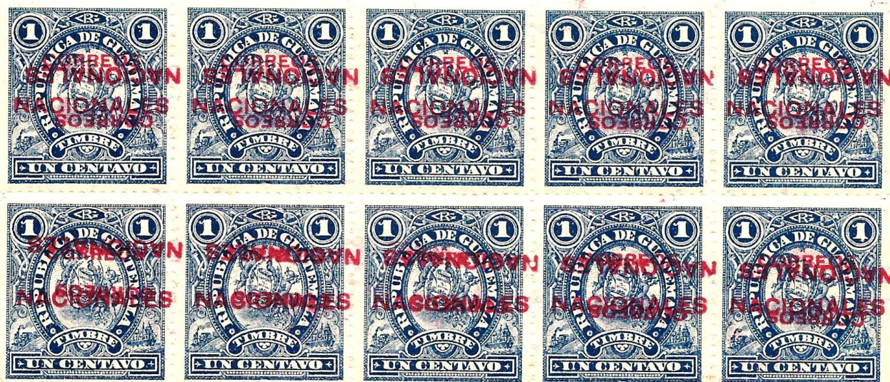
Scott 86 Forgery Correos — 16mm Nacionales — 25mm Height — 10mm