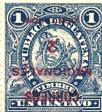
Scott 87 Forgery Correos — 13.75mm Nacionales — 20.5mm Centavos — 13.5mm Height — 22mm